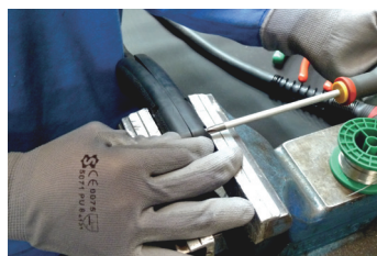
After-sales service & repairing / maintenance All brands