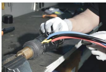
Technical support / retrofit