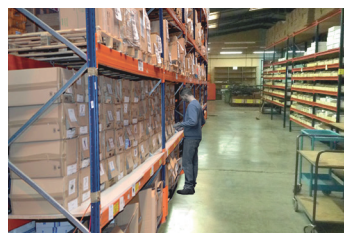
Logistics & stock management Availability and ability to react

www.torchessolutions.eu | contact@torchessolutions.eu