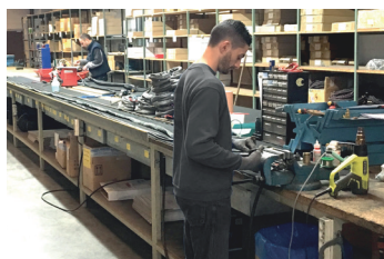
Standard & custom manufacturing